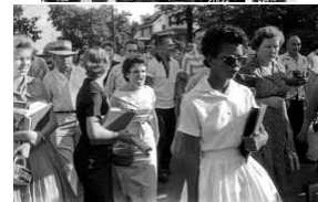
Civil Rights Act of 1957