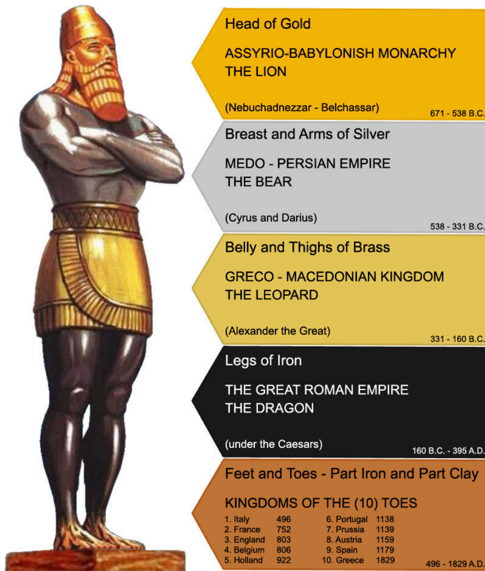
Nebuchadnezzar's Dream (Daniel 2)

Nebuchadnezzar ruled the Neo-Babylonian empire from 629—539 BC. He was a warrior king who expanded the empire by taking over remaining Assyrian territories. He also built notable structures, including the Ishtar Gate